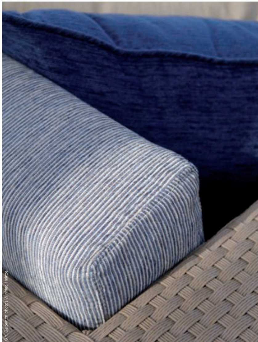
S.Y. Salperton